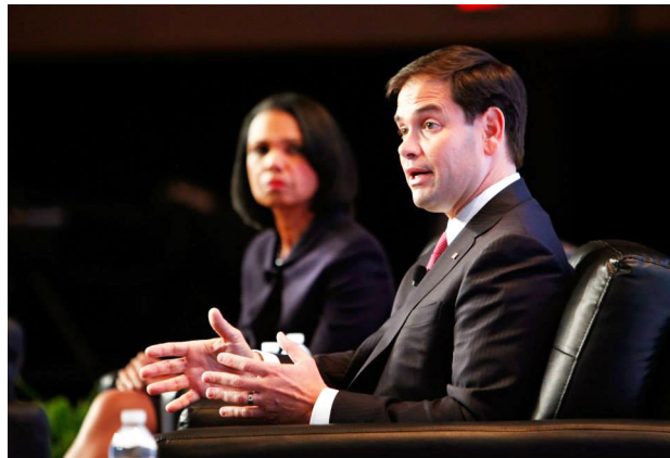
Senator Marco Rubio and Dr. Condoleezza Rice share the stage at the National Summit on Education Reform, November 20 in Washington, DC.

In the end, said Rubio, "schools don't raise children; families raise children. Schools are a tool available to those families to equip those children to be successful...and have better lives than their parents." Offering choice "is one of the best things we can do to be pro family."