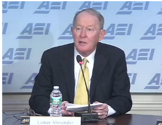
U.S. Senator Lamar Alexander (R-TN) speaking at the American Enterprise Institute in Washington, DC, January 28, 2014.

Describing his Creating Hope and Opportunity for Individuals and Communities Through Education (CHOICE) Act , Scott said, “Here’s an opportunity for us for fewer dollars to get a better outcome and to see kids maximize their potential, because what government should do is get out of the way when necessary and let the private sector and competition drive better results at lower prices and create a path for a higher quality of life.”