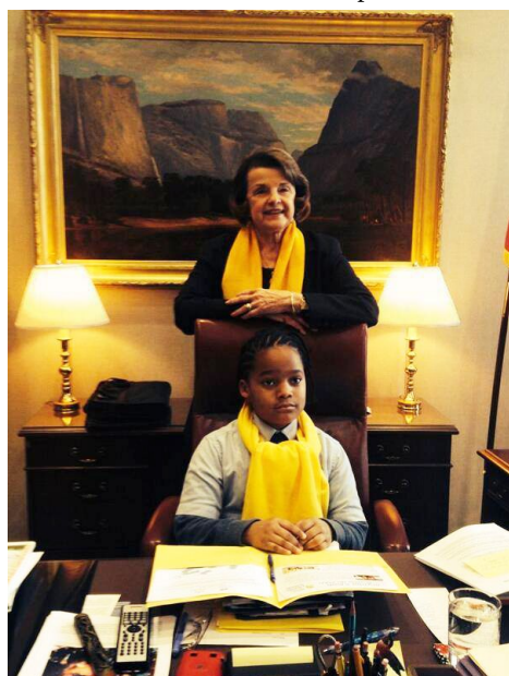
U.S. Senator Dianne Feinstein (D-CA), wearing a School Choice Week scarf, meets in her office January 29 with a student currently benefiting from the D.C. Opportunity Scholarship Program.