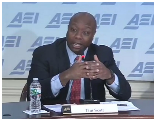
U.S. Senator Tim Scott (R-SC) speaking at the American Enterprise Institute in Washington, DC, January 28, 2014.