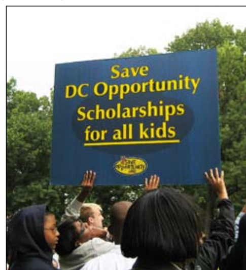
Supporters thrust high their placard at the "Save School Choice" rally September 30.

Specific contest rules, judging standards, and procedures for submitting videos are available on the department's Web site at <http://www.ed.gov/iamwhatilearn/>.