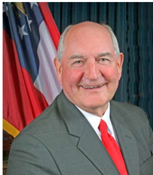
Georgia Governor Sonny Perdue

The Alliance for School Choice estimates that the tax credit programs in states other than Georgia serve more than 92,500 children. Pennsylvania's program has the farthest reach, with more than 38,000 scholarships awarded in 2007-08. In terms of dollars available, Georgia's new $50 million initiative makes it the third largest in the country, following Florida's