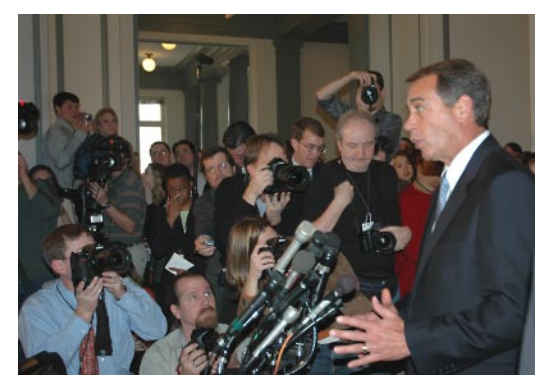
Newly elected Majority Leader John Boehner meets the press.

a spot on my soul like this issue of education." Expressing frustration about the "achievement gap in American education between advantaged students and their disadvantaged peers," he said the nation