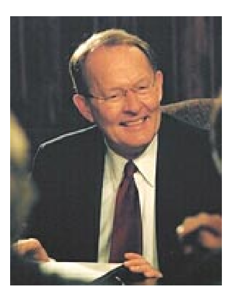
Senator-elect Lamar Alexander

On the House side, the Republican gain of at least five seats would seem to improve the chances for school choice