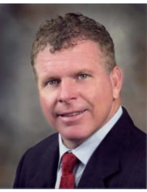
Congressman-elect Tom Feeney (R-FL)

dent's Commission on Excellence in Special Education recommended that the revised IDEA "should allow state use of federal special education funds to enable stu-