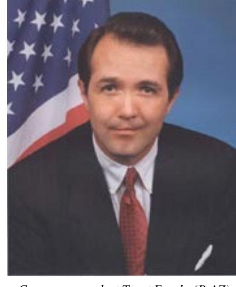
Congressman-elect Trent Franks (R-AZ)

tend schools that work, tax credits for corporations that support school choice, scholarships for students with special needs, and revisions to the Blaine amendment in the state's constitution.