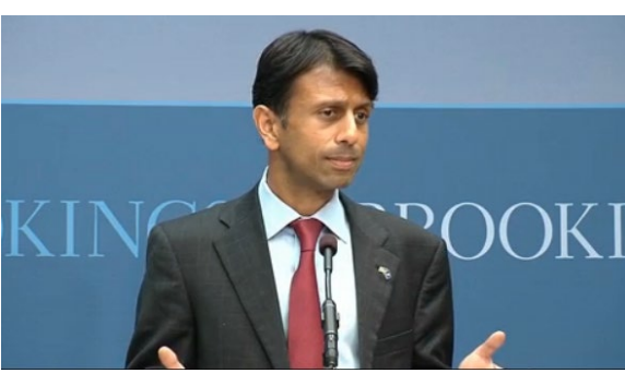
Governor Bobby Jindal of Louisiana delivers a keynote address December 11 at the Brookings Institution in Washington, DC.

an interactive web application from Brookings that ranks public school districts on their ability to provide school choice and competition, Jindal explained why the Recovery School District in New Orleans was the top-ranked district on the index and also set out a blueprint for improving