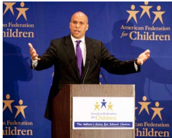
Newark Mayor Cory Booker speaking at the AFC policy summit May 4 in Jersey City, NJ.

Louisiana Governor Bobby Jindal, who recently signed two sweeping school choice bills, spoke during dinner and told the audience, "The truth and the people are winning when it comes to education reform."