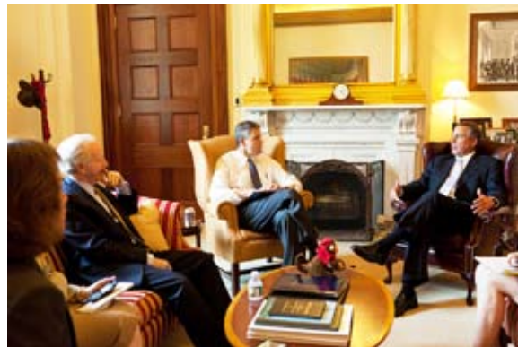
Speaker Boehner meets with Arne Duncan, Secretary of Education, and Senator Joe Lieberman in his office in the U.S. Capitol. May 17, 2012.

In another school choice development, House Speaker John Boehner (R-OH) and Senator Joe Lieberman (I-CT) met with Secretary of Education Arne Duncan May 17 to urge him to fully and expeditiously implement the Opportunity Scholarship Program (OSP) in the District of Columbia. Officials at the U.S. Department of Education have capped enrollment in the OSP in accordance with President Obama's budget proposal to zero out funding for program. But the act that authorized the program contains no enrollment cap, and Boehner expects the program to be fully funded in the coming fiscal year.