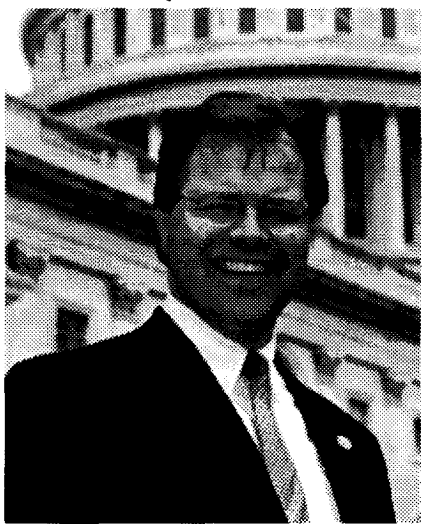
Representative Bob Schaffer (R-CO)

sounded in the past by people opposed to school choice is that such programs would rob resources from public schools. But the tax credit under consideration would actually grow resources for public schools. It would expand the funding pie and provide new dollars to supplement tax support. Think how much easier it would be for a public school to raise funds for field trips or team uniforms or band instruments if corporate or individual donors could take a significant portion of their contributions as a tax write-off. With 90 percent of schoolage children in public schools, there is every reason to expect that the bill's beneficiaries would overwhelmingly be