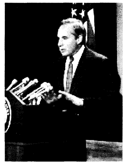
Senator Robert Torricelli (D-NJ) at a press conference.

Both Torricelli and Hutchinson, in coordinated statements, emphasized the broad benefits of education savings ac-