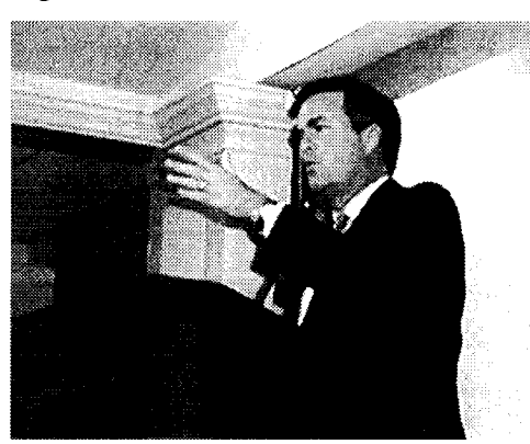
Florida Governor Jeb Bush

An editorial in the same edition of the magazine notes it is becoming "increasingly difficult for liberals to deny that vouchers may be appropriate in the most critically needy and dysfunctional school districts."