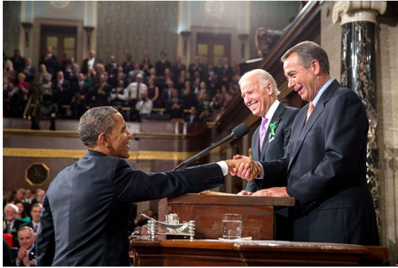
President Barack Obama greets Vice President Joe Biden and House Speaker John Boehner before delivering the State of the Union address Feb. 12, 2013.

The fate of the president’s proposal in Congress seems uncertain. In a statement of response, House Committee on Education and the Workforce Chairman John Kline (R-MN) wondered whether the plan would be duplicative, effective, and affordable. “We all want to give children a solid foundation for a bright future, but that also means we can’t saddle them with even more debt.” Kline expressed confidence that an approach to early education could be found that would “promote parental choice” and “ensure an appropriate federal role in education.”