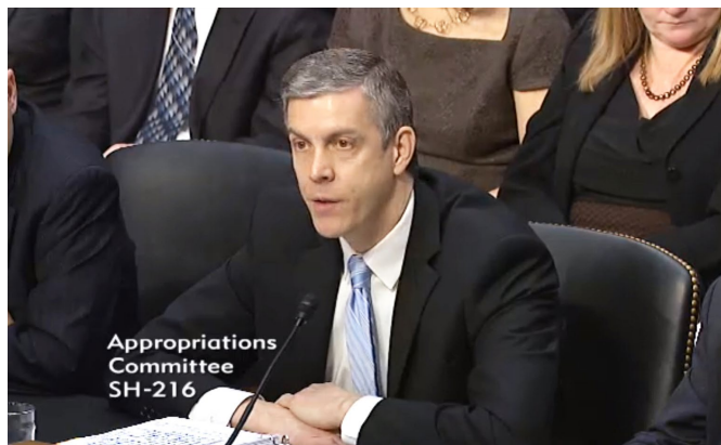
U.S. Secretary of Education Arne Duncan testifies before the Senate Appropriations Committee February 14, 2013.

“four education-related buckets” found in Now Is the Time , President Obama’s plan to reduce gun violence. He said the proposal is designed (1) “to ensure that every school