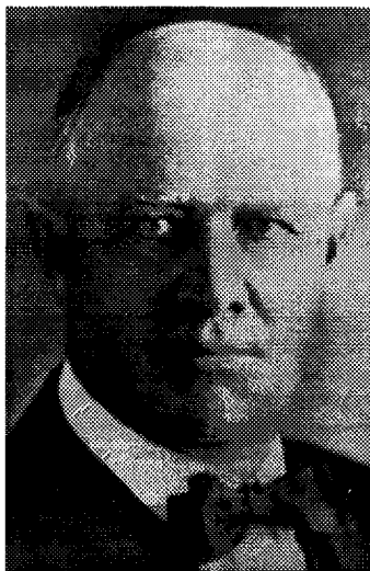
Gov. Walter M. Pierce