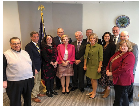
State CAPE leaders meet with Education Secretary DeVos.

"The Trinity Lutheran decision reaffirmed the long-understood intent of the First Amendment to not restrict the free exercise of religion," said Secretary DeVos. "Those seeking to provide high-quality educational services to students and teachers should not be discriminated against simply based on the religious character of their organization."